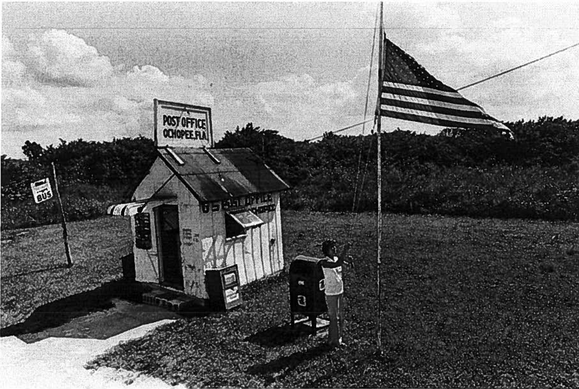
Ochopee Post Office, Florida, 1970s

The following photo, from the Web site of the United States Postal Service, shows the Ochopee Post Office, the smallest free-standing post office in the United States.